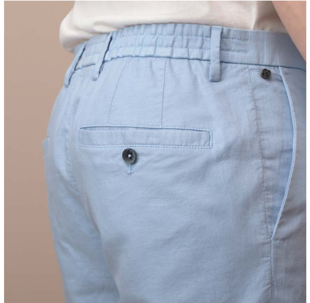
Short version of the Davide model. Bottom with 3.5 cm turn-ups.