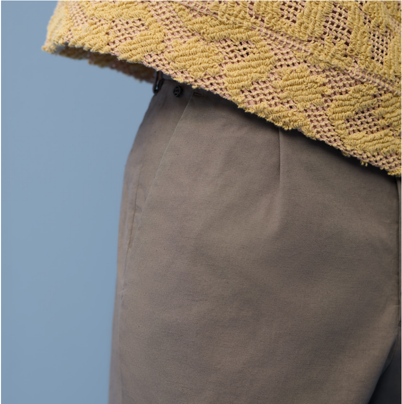
Regular-fit model with a single pleat and straight leg. Closure with hook and extended waistband tab with concealed button. American-style front pockets. The back is defined by a central sartorial “split vent” on the waistband and double 1 cm welt pockets without buttons.